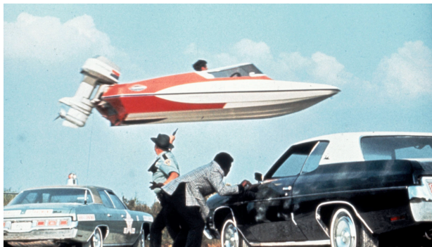
Live and Let Die