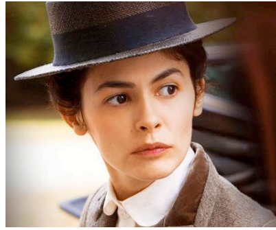
Coco Before Chanel